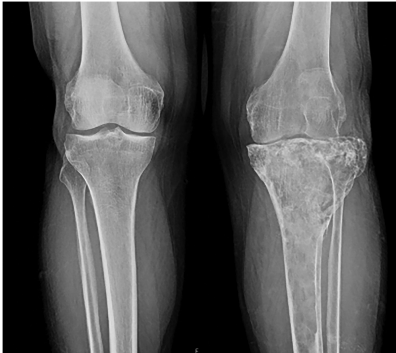
Figure 1. A 54-year-old male patient presented with progressively worsening pain and swelling localized to the left knee. Initial radiological evaluation using anteroposterior X-ray imaging demonstrated extensive lytic-destructive lesions predominantly involving the proximal metaphysis of the left tibia. Radiographic features included marked trabecular disruption, cortical thinning, and expansion of the medullary cavity. Given these aggressive radiological findings, a primary bone malignancy, particularly chondrosarcoma, was considered a preliminary diagnosis.