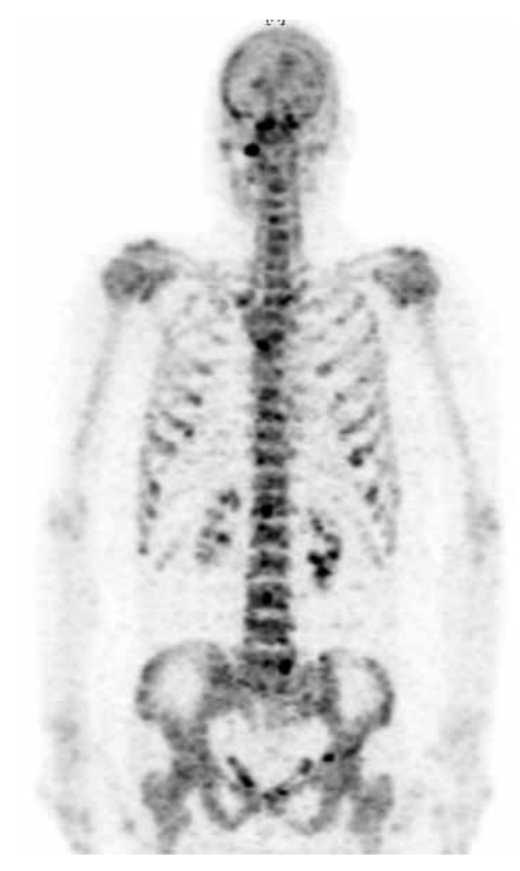
Figure 3. Whole body maximum intensity projection <sup>18</sup>F-NaF positron emission tomography/computed tomography image of the patient. Intense <sup>18</sup>F-NaF uptake was seen in sclerotic bone lesions